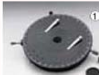
BX41 Rotating Stage