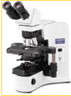
BX41 (shown without rotating stage and polariser kit fitted)