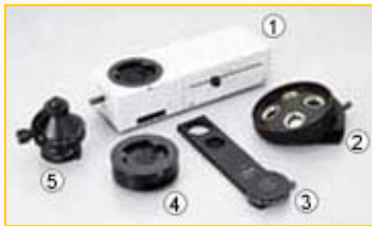
BX41 Polariser Kit