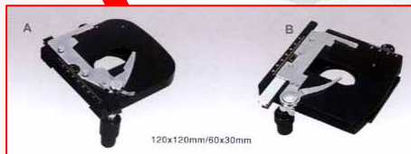
Double layer stages with coaxial controls