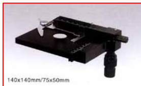
Single layer stage with coaxial controls