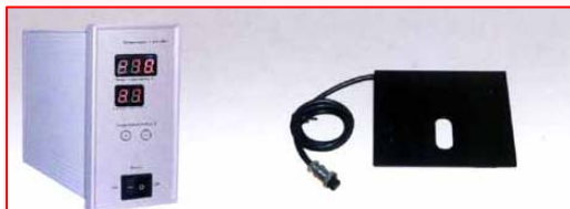
Single layer heated stage