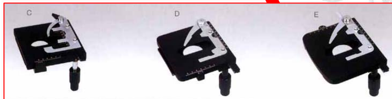
Double layer stages with coaxial controls and dual slides