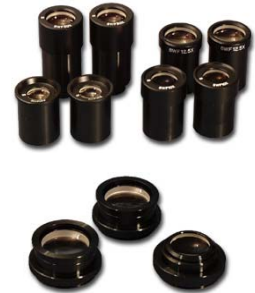
Magnification Table for EMZ Zoom Bodies